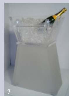
7 Ice Bucket fitted with castors and towel rail in clear and sandblasted acrylic. 510x230x680mm