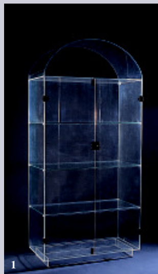
1 General Ceramic Cabinet Elegant free standing acrylic cabinet with 3 glass shelves, double door with brass hinges and lock. The arched canopy is detachable. 915x455x1575mm high 1830mm high with canopy GCC

Dauphin's cabinet range is made from clear cast acrylic allowing light to be absorbed with minimum reflection. The housed artefacts are clearly seen, while the surrounding cabinet becomes unobtrusive. The cabinets are free standing or wall mounted, with lockable doors, brass or acrylic hinges. On large models the shelves are made from reinforced glass to support greater weights. Custom designs, incorporating other materials including marble, wood and coloured acrylic can be achieved. To obtain further information or discuss custom designs, please contact as below.