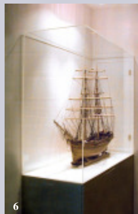
6 Display Cabinet with Microclimate Control for vulnerable artefacts that need a constant environment. Prices on application