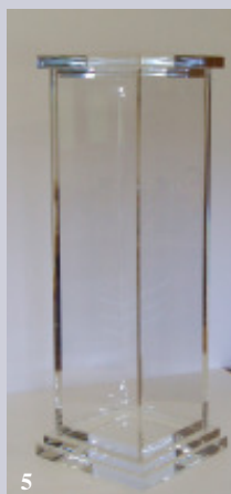
5 Plinths for busts and statues in three sizes S 295x295x915mm M 295x295x1120mm L 295x295x1320mm