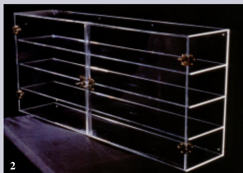
2 Wall Mounted Display Cabinet All acrylic cabinet designed to take collections of small items keeping them safe and dust free. DWCD1 925x100x610mm high DWCD2 1015x165x710mm high

Dauphin's cabinet range is made from clear cast acrylic allowing light to be absorbed with minimum reflection. The housed artefacts are clearly seen, while the surrounding cabinet becomes unobtrusive. The cabinets are free standing or wall mounted, with lockable doors, brass or acrylic hinges. On large models the shelves are made from reinforced glass to support greater weights. Custom designs, incorporating other materials including marble, wood and coloured acrylic can be achieved. To obtain further information or discuss custom designs, please contact as below.