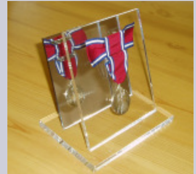
Acrylic support is backed with a mirror to reflect the reverse side of the Medal