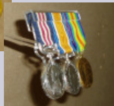
Ribbons are clamped with an Acrylic bar and supported with Acrylic Pins