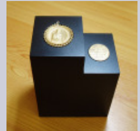
Medals and Coins displayed on Matt Black Acrylic Plinths with Acrylic support arms and recesses