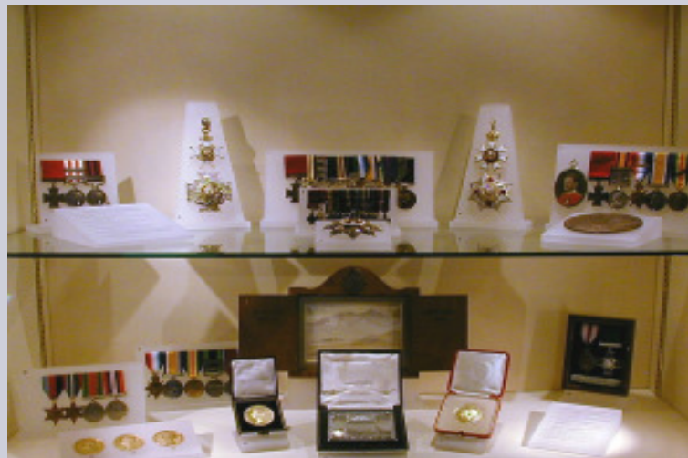
Collection of Medals and Coins displayed at Wellington College using Sandblasted Acrylic