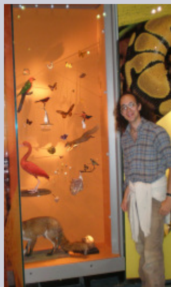
A long curve of cabinets have been created to house various articles of natural science, divided into colours of the rainbow.