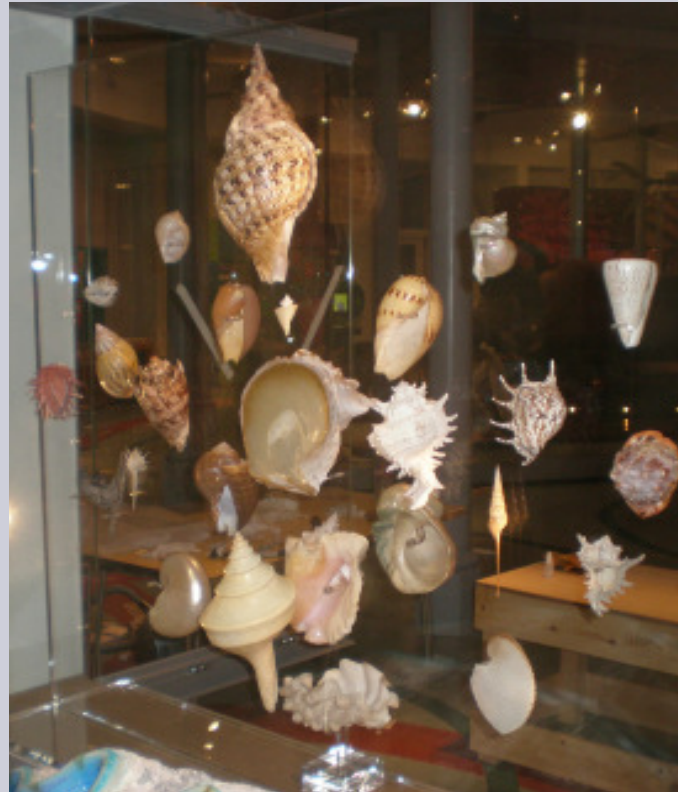
Shells are displayed on both sides of a 2 meter square of Acrylic with invisable but safe rods of acrylic.

Contact Alex Abbott For further Dauphin Data News