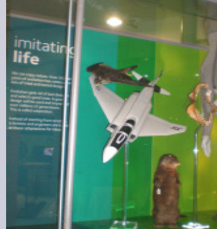
An aircraft displayed to simulate the flying facon, supported on a custom made Acrylic stand